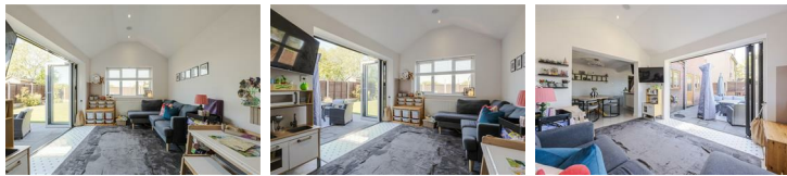
Snug 12'1" x 9'6" (3.70 x 2.91)